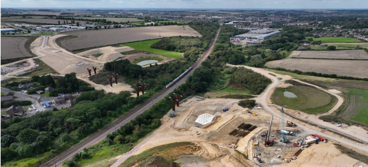
GSRR – Construction of Viaduct looking north along the ECML towards Grantham