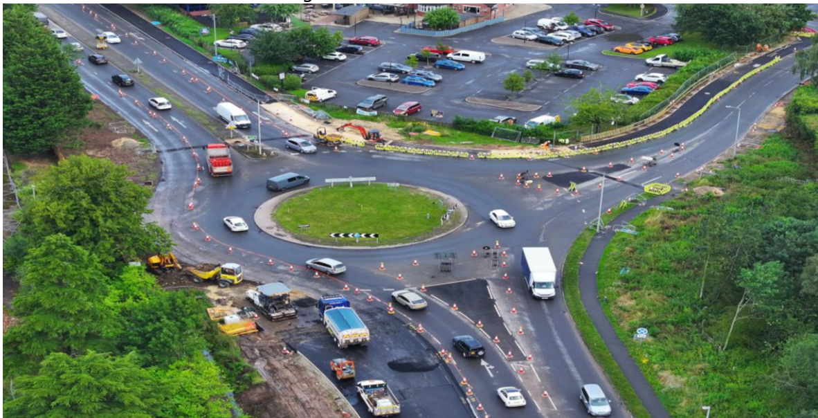
Marsh Lane Roundabout Widening

5.1 Marsh Lane Roundabout and Boston Active Travel projects are progressing well. A myriad of works have taken place which includes, slitter island removal, roundabout widening, BT diversions, drainage and gully installation, footway reconstruction across the whole site, street lighting installation, sign posts installed, widening of footway around the Spirit of Endeavour. Further works have included nighttime trial holes for Cadent so they can better understand the depth of their own assets. The works remain on target for completion at the end of 2023.